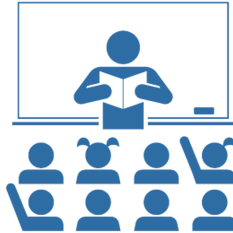
Teacher, Firefighter, Postal Carrier

AN EDUCATOR MAKING $12 AN HOUR CAN AFFORD A RENTAL HOME FOR $650/MONTH, OR A $45,000 HOME.