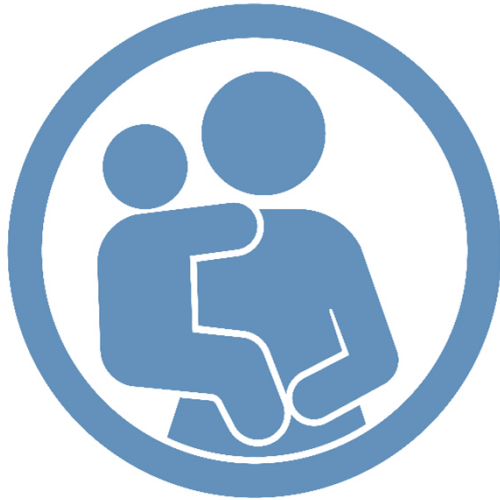
Early Childhood Educator, Healthcare Aide, Warehouse Worker

AN EDUCATOR MAKING $12 AN HOUR CAN AFFORD A RENTAL HOME FOR $650/MONTH, OR A $45,000 HOME.